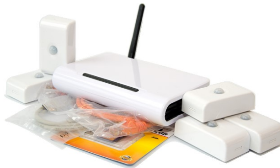
Fig. 1. BuildAX Environmental Sensor Toolkit: including logger, sensor nodes and supplied cables

The sensor toolkits distributed to FMs and students consisted of a base unit logger (see Fig. 1) which receives data from sensor nodes with a range of approximately 100m line-of-sight and logs this to memory (SD card), with optional network access. The sensor nodes incorporate factory-calibrated temperature, humidity, light, passive infrared (PIR), and magnetic reed switch sensors 2 . The sensors were configured to broadcast data packets at a resolution of 30 seconds, or 120 samples per hour, to allow analysis in tools such as Microsoft Excel which